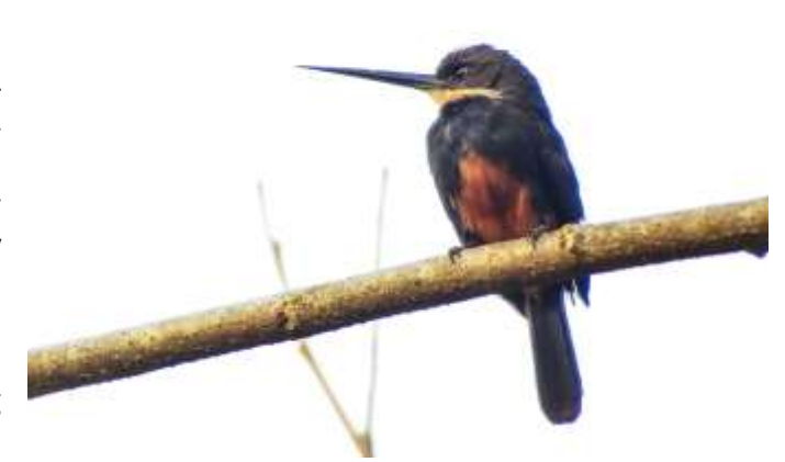
Dusky-backed Jacamar Panama's Darien Lowlands: Canopy Camp, 2026

road at El Salto, an excellent area for raptors, as well as for multiple species of trogons and woodpeckers, Whooping Motmot, Gray-cheeked Nunlet, Barred Puffbird, Double-banded Graytail, Black Antshrike, Bare-crowned Antbird, Yellowbreasted Flycatcher, Black-bellied and Whiteheaded wrens, and Yellow-backed Orioles, among many others. Trails at El Salto and nearby Tierra Nueva, as well as those at the Canopy Camp, will allow us access into the heart of the forest, maximizing our chances of ferreting out the more secretive forest interior species. We'll also hope to spend one full day birding by boat along the Río Chucunaque and Río Tuquesa to an Emberá community called Nuevo Vigia, which ventbird.com