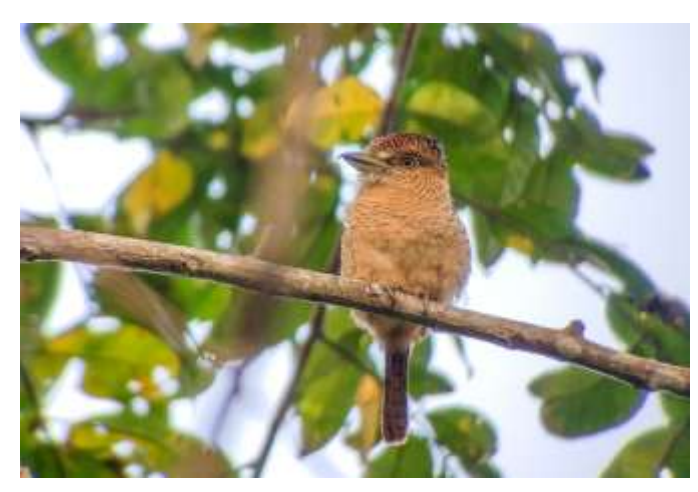
Barred Puffbird

January 11, Day 2: Tocumen to the Bayano Valley, and on to the Canopy Camp, Darién. An early start will take us to the lowlands of eastern Panama Province and the region surrounding Bayano Reservoir. Much of the area between here and Panama City has been deforested and converted to cattle pasture, but there is still extensive, selectively logged forest beyond the reservoir. The margins of the reservoir are good places to find Cocoi Heron, Bare-throated and Rufescent tiger-herons, Pied Water-Tyrant and several species of kingfishers. However, it is in the forest where we will concentrate our time. The forest here has an interesting composition, with drier, semi-deciduous forest pockets of